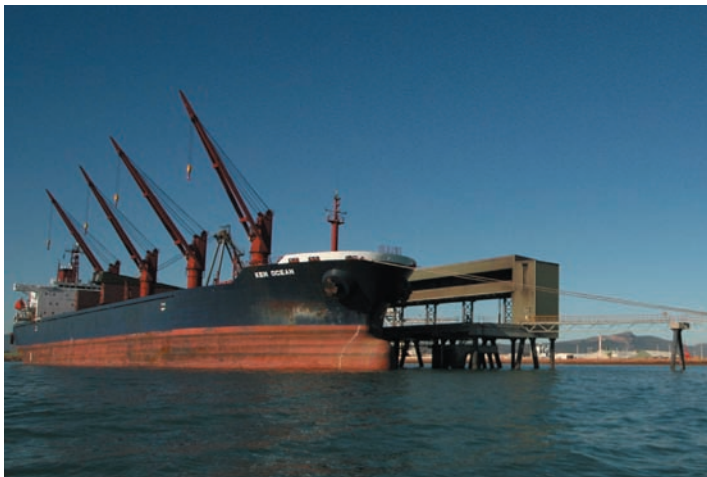
Loading concentrates at Berth 11 in the Port of Townsville.

BHP Billiton Cannington has been in operation since October 1997.