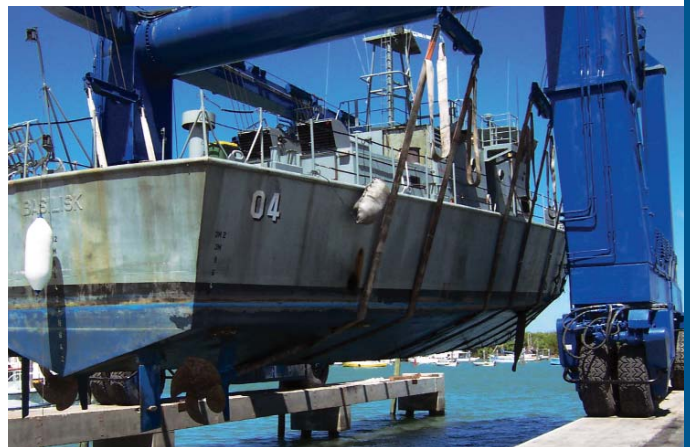
A Defence Force Pacific Patrol boat HMPNGS Basilisk is lifted for re-fit using Rosshaven Marine's recently-acquired 180 tonne ship lift.