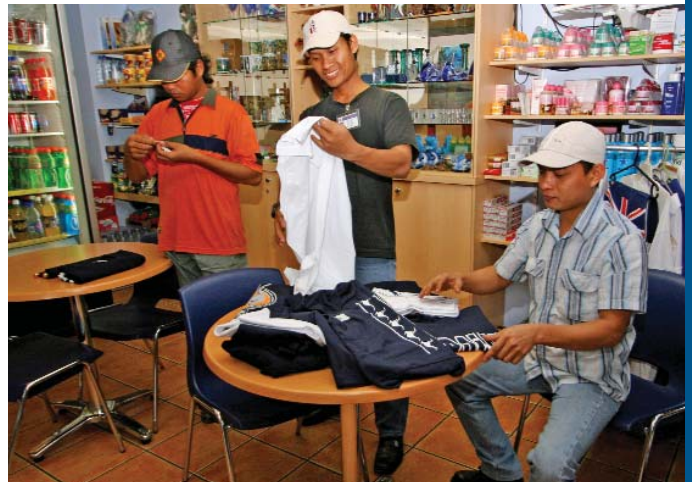
Sailors take a look at what's on offer at the Mission to Seafarers.

The canteen provides the necessary articles required for daily life, from toiletries and snack food to a postal service, internet cafe and phones for communication with loved ones.