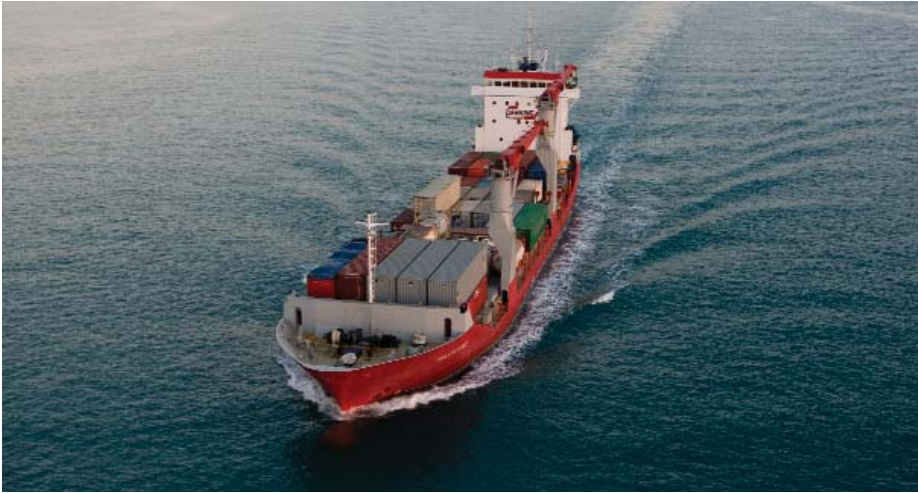
Halifax Bay is now operational from the Port of Townsville.

The Halifax Bay commenced a new trade route between Townsville and Weipa in September, operated by Perkins Shipping.