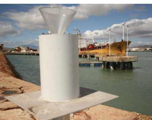
Dust gauge located near Berth 1 at the Port of Townsville.

Environmental performance is a key area for Townsville Port Authority and the Port as a whole. The Authority is committed to protecting the environment for a sustainable future.