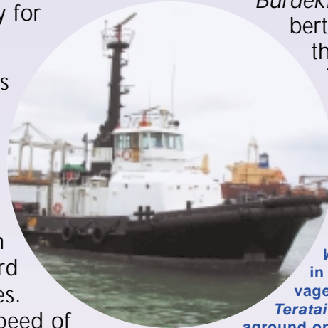
Werra was involved in the successful salvage of the Bunga Teratai Satu that ran aground on Sudbury Reef off Cairns in November 2000.

The Werra replaces the Burdekin and is berthed alongside the Giru at Townsville Port. It is yet to be decided where the Burdekin will be redeployed to.