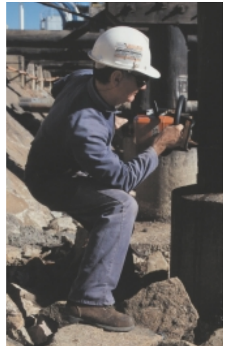
A TPA employee undertakes maintenance work under one of the berths.

If you would like further information about port maintenance work, please do not hesitate to contact us.