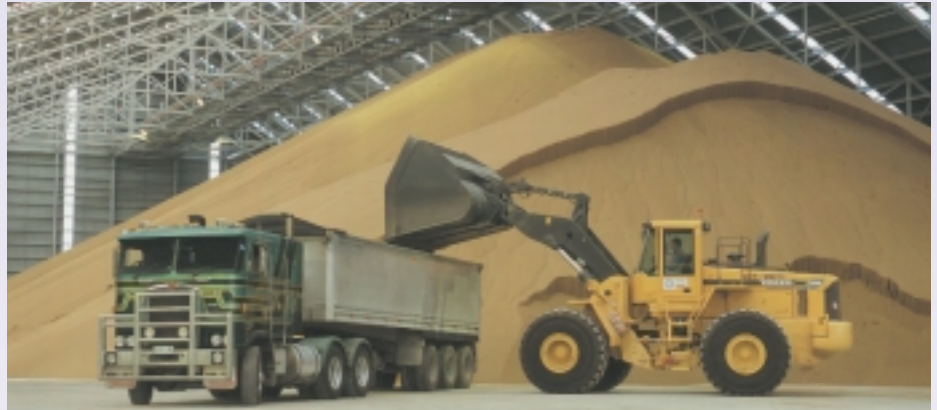
WMC Fertilizer reached a milestone in February 2001.

sold to Australian markets and domestic sales were expected to rise to 430,000 tonnes this year.