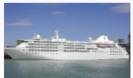
Silver Wind visited Townsville Port on an around the world trip with 182 passengers on board.

The Silver Cloud docked at Townsville Port on 12/03/01 for a day visit. The luxury cruise ship came from Noumea and stopped while on journey to Cairns and Darwin. With 104 passengers on board and 208 crew, this vessel is definitely one of the more expensive and luxurious cruise ships.