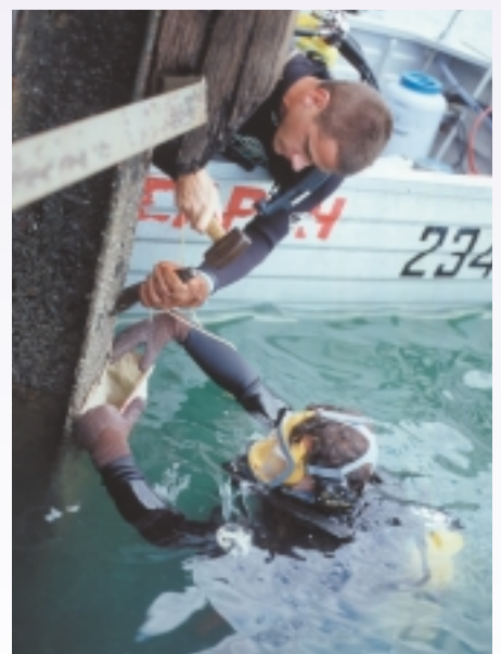
Divers sampling for marine pests in the port.

The project started in September 2000 and is expected to take about 9 months. A progress report is due to be released in March 2001 and a final report in May 2001.