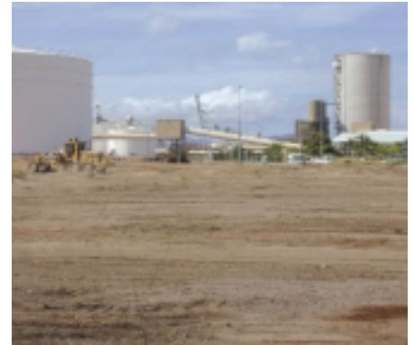
Construction began on Townsville Warehousing & Container Services' new facility in February 2001.