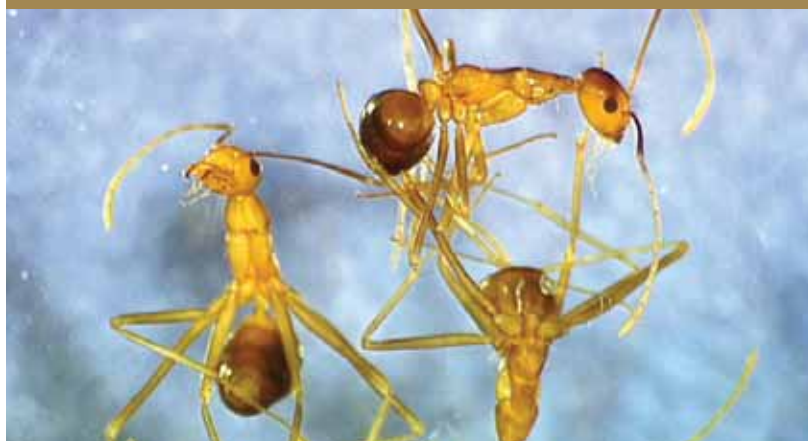
Photo: Anoplolepis gracilipes

Crazy ants were detected at Townsville seaport on a pallet in a shipment from Papua New Guinea in 2002 during routine post arrival inspection. Although the ants were contained, it provides a reminder of the need for vigilance at our border. If you see an ant fitting the description, please contact AQIS on 07 4789 4888.