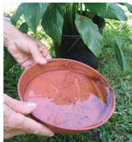
Pot plants are an ideal dengue mosquito breeding area