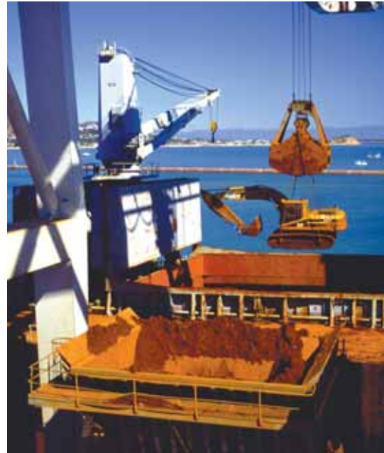
Unloading nickel ore from a vessel at the Port. The nickel ore is carried by train to Yabulu where it is refined into nickel.

Ravensthorpe concentrate will be imported through the Port for further refining at Yabulu, increasing nickel production at Yabulu by more than 140% to an estimated 76,000 tonnes per annum, with the life of the refinery being extended a further 25 years.