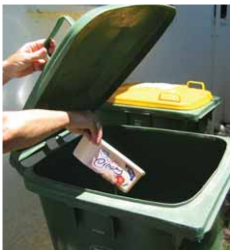
Throw out rubbish that collects water

Dengue Fever symptoms include: sudden onset of fever lasting three to seven days, intense headache, especially behind the eyes, muscle and joint pain, loss of appetite, vomiting and diarrhoea, skin rash, minor bleeding and extreme fatigue.