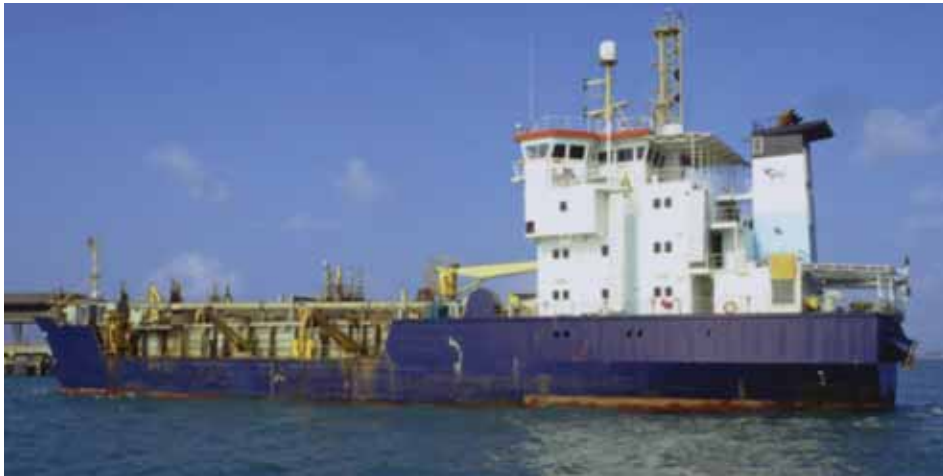
Dredging vessel the Brisbane at work in the Port of Townsville.

AS part of annual port maintenance, the 2004 dredging campaign has been completed in the inner harbour, the outer harbour and the shipping channel by the trailing suction dredge Brisbane as part of on its annual northern dredging campaign, which included visits to the ports of Weipa, Cairns, Mackay and Gladstone.